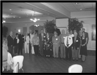
Board Members Installed