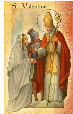
His Feast Day is February 14